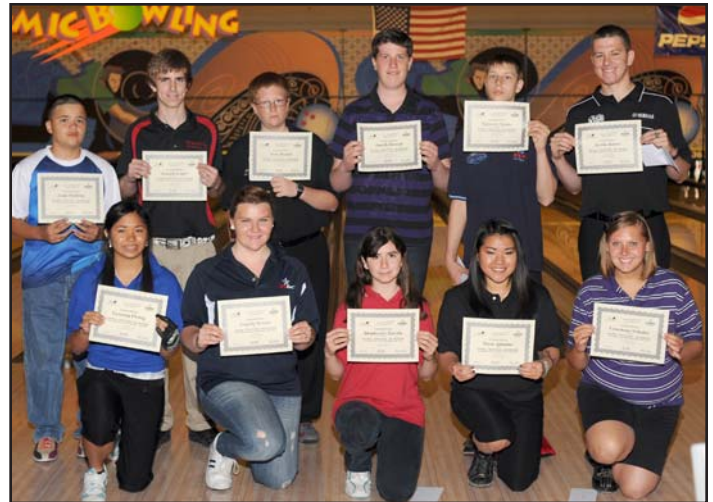
All first place finishers from the District Finals held in March received a $50 Scholarship for their outstanding performance!

366 total bowlers participated in the State Finals at Fountain Bowl – Fountain Valley, May 1-2, 2010.