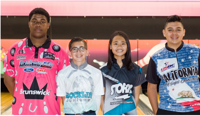
DIVISION A LEFT RIGHT LEFT RIGHT FIRESIDE