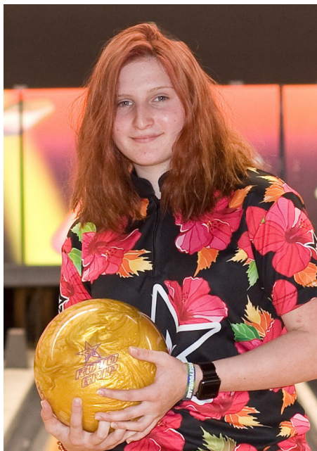
DIVISION D – COUNTRY CLUB BRI FIZER