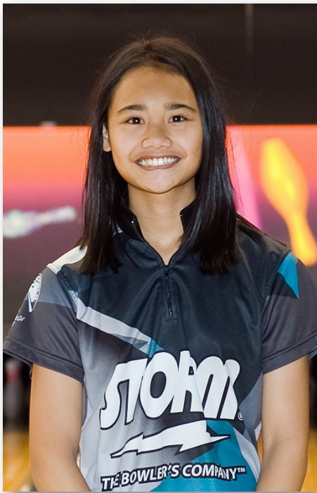
DIVISION A FIRESIDE LANES