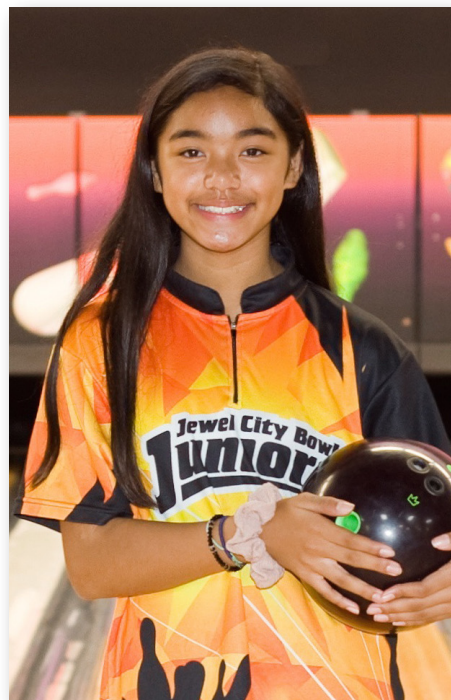
DIVISION E JEWEL CITY BOWL