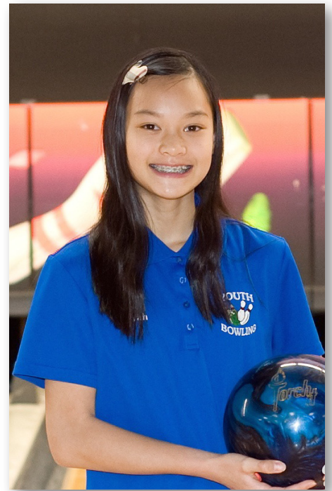
DIVISION C CHAPARRAL LANES