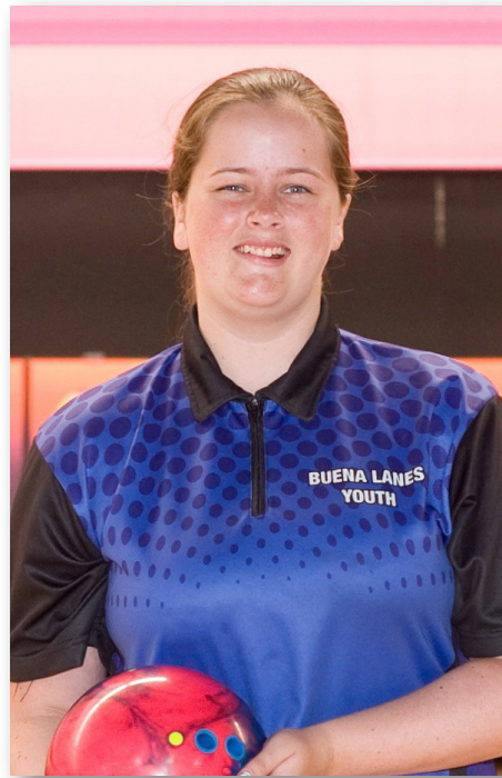
DIVISION B BUENA LANES