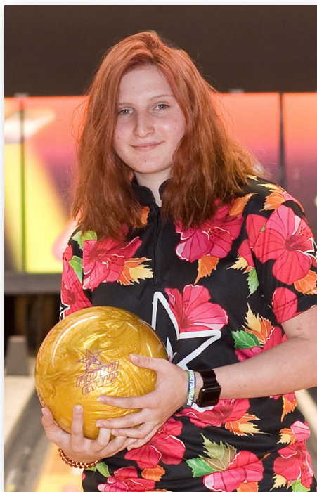
DIVISION D COUNTRY CLUB LANES