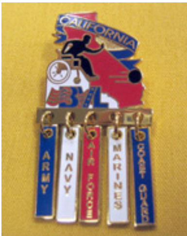
BVL Dangle Lapel Pins will be available for purchase for $5.00 each at the Helen Duval Veterans Tournament

Amounts collected and payment distributions can be viewed online at CALUSBC.com . Awards will be provided to the top three local associations that donate the highest amounts. Awards for those donations will be presented at the California USBC Awards Banquet on Saturday, May 31, 2025 in San Jose.