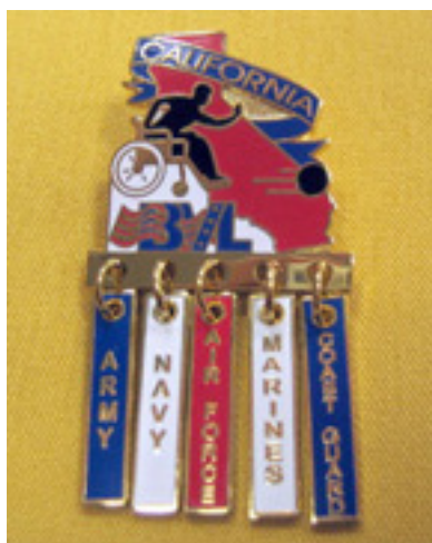
BVL Dangle Lapel Pins will be available for purchase for $5.00 each at the Helen Duval Veterans Tournament

Amounts collected and payment distributions can be viewed online at CALUSBC.com . Awards will be provided to the top three local associations that donate the highest amounts. Awards for those donations will be presented at the California USBC Convention on Saturday, May 30, 2026. Visit CALUSBC.com for convention location.