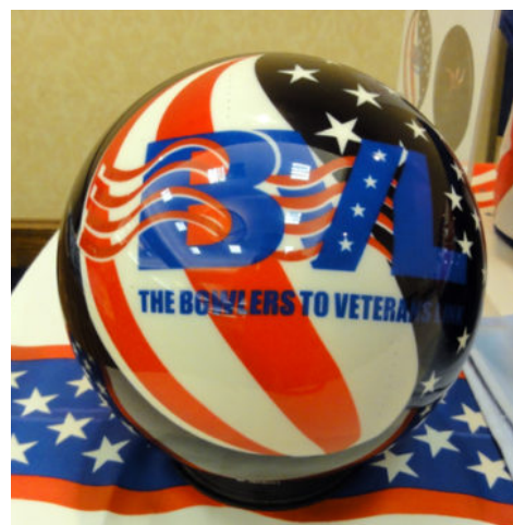
BVL bowling ball raffle will be held at the Helen Duval Veterans Tournament

We donated $108,000 to BVL for the 2024-25 Season.